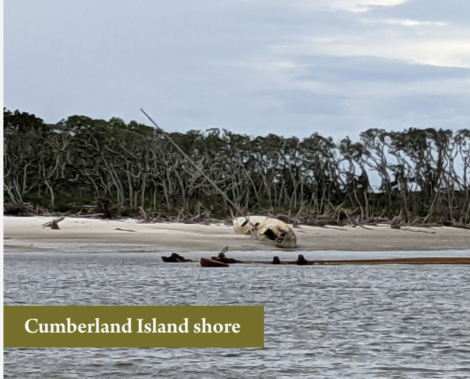
Cumberland Island shore

This novel features a character who takes film photos of the island with a Brownie camera. Let these photos help you set the scene for the island while you discuss the book.