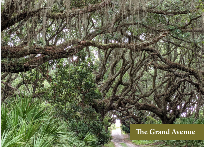
The Grand Avenue