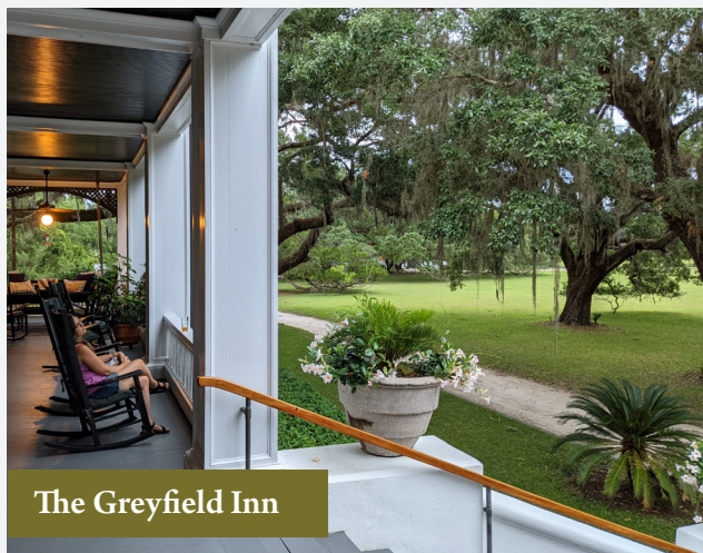
The Greyfield Inn