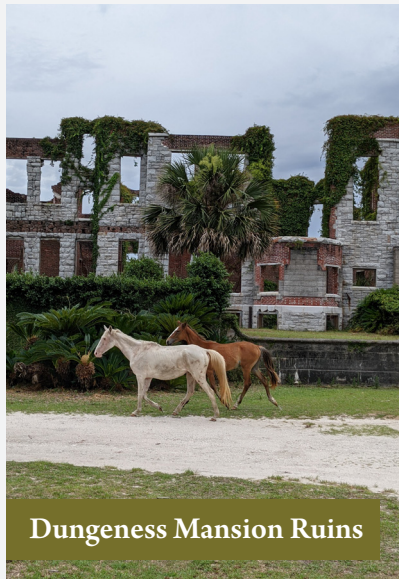
Dungeness Mansion Ruins

This novel features a character who takes film photos of the island with a Brownie camera. Let these photos help you set the scene for the island while you discuss the book.