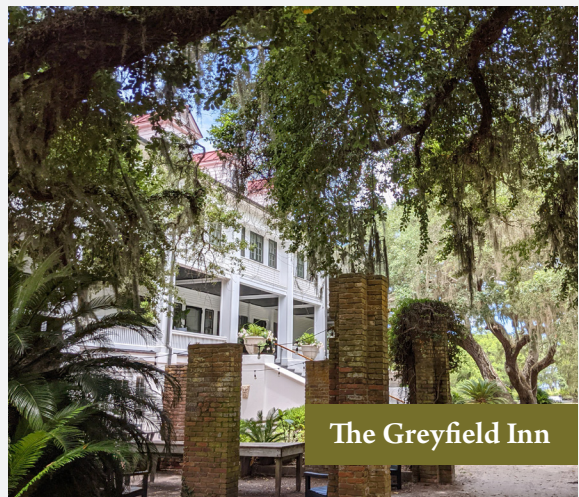
The Greyfield Inn